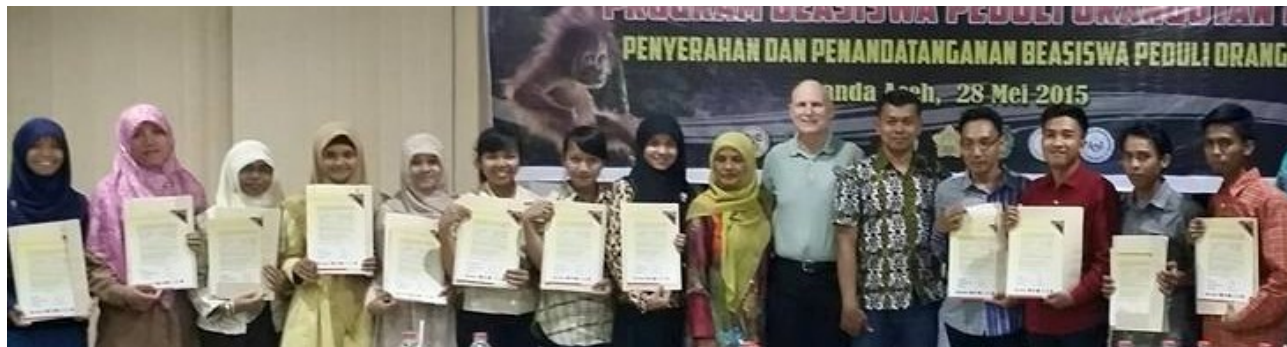
Left: Presentation evaluation in progress in Sumatra. Above: Recipients of 2015 Sumatra Orangutan Caring Scholarships honored.