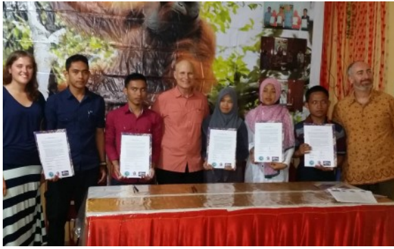
The five recipients of OCS in W. Kalimantan (2015)

A special five-year scholarship may be available for veterinary students needing another year of internship to graduate as practicing veterinarians. The number of scholarships we are able to award are based on the level of funding we receive.